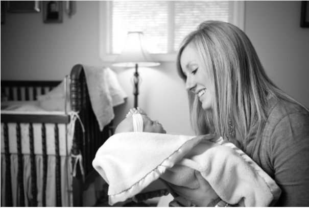
People interact differently with babies based on the babies' gender. How do sociologists analyze these interactions?

disentangling what is natural from what is socially constructed, the more rigorously you will begin to think like a sociologist.